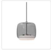
PD70610-SM/BN Smoked/Brushed Nickel