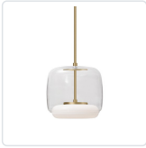
PD70610-CL/BG Clear/Brushed Gold